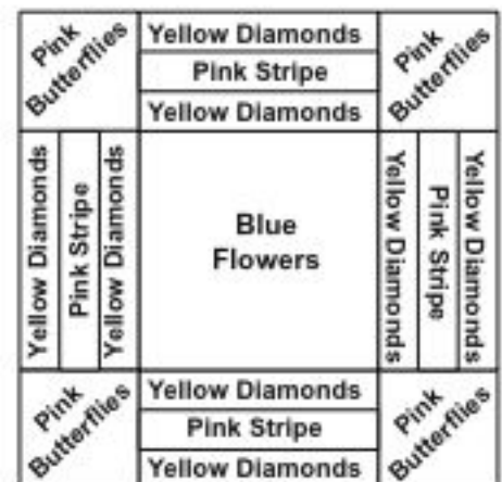
Block Two Layout