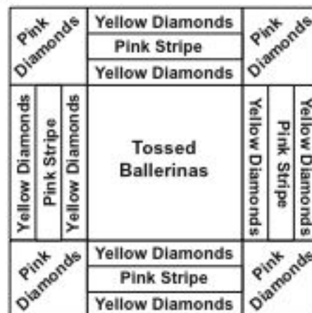
Block One Layout